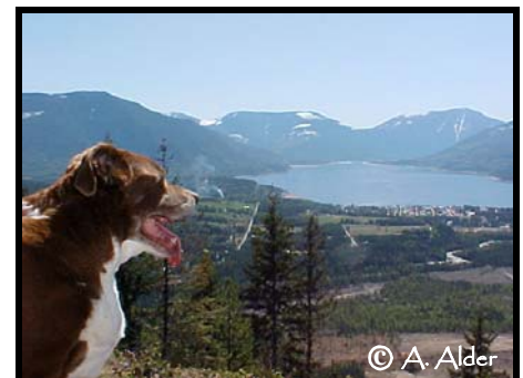
Rizzo at the 1st Viewpoint

If you like a summer ascent with a great view, try Saddle Mtn. Lookout Trail or Silver Cup Ridge. If you are looking for other moderate hikes close to town, try Kimbol Lake, Rosebery Railbed or the Nakusp Hot Springs Trail.