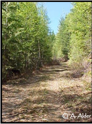
Old fire road leads to great views